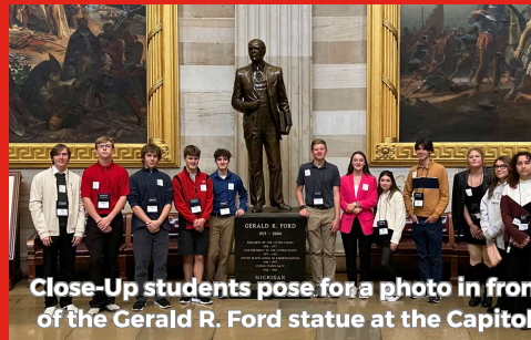
Close-Up students pose for a photo in front of the Gerald R. Ford statue at the Capitol.