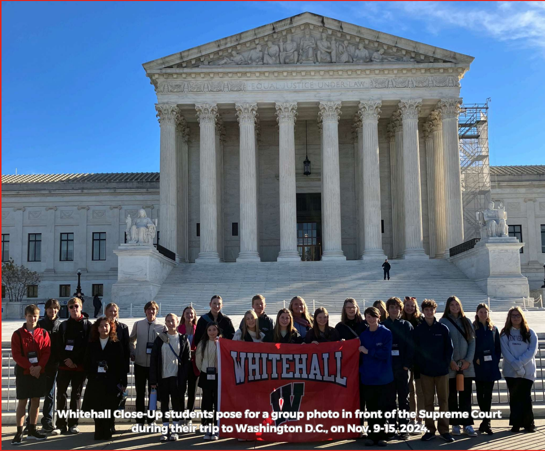
Whitehall Close-Up students pose for a group photo in front of the Supreme Court during their trip to Washington D.C., on Nov. 9-15, 2024.