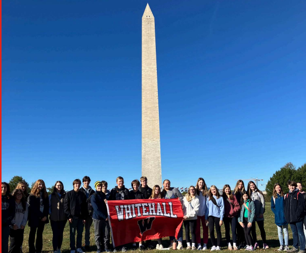
Close-Up students pose for a group photo in front of the Washington Monument.